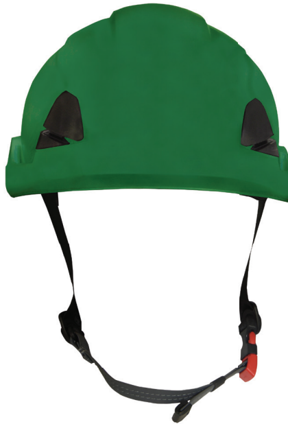
(Front with Chin Strap)