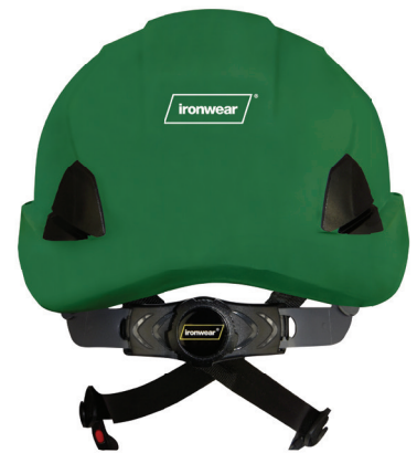
(Back with Ratchet)